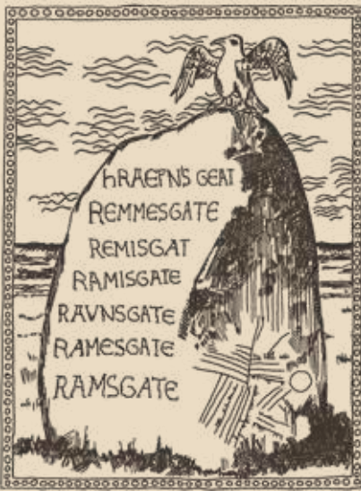
illustration by a local, neurodiverse artist

From the late 1940s, a ram jumping over a gate was used to promote Ramsgate. The character Rammy Raven is a nod to the Ram and to the original Anglo Saxon name for Ramsgate!